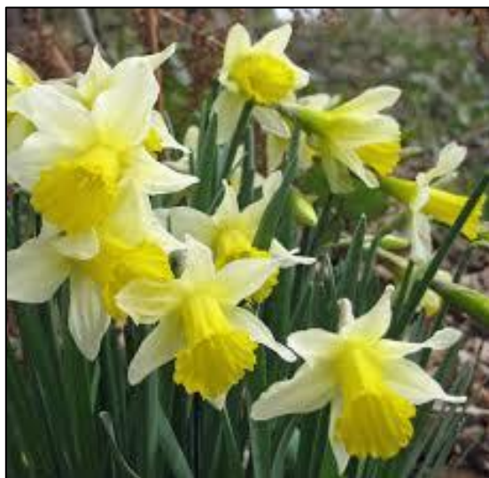
The Lent Lily