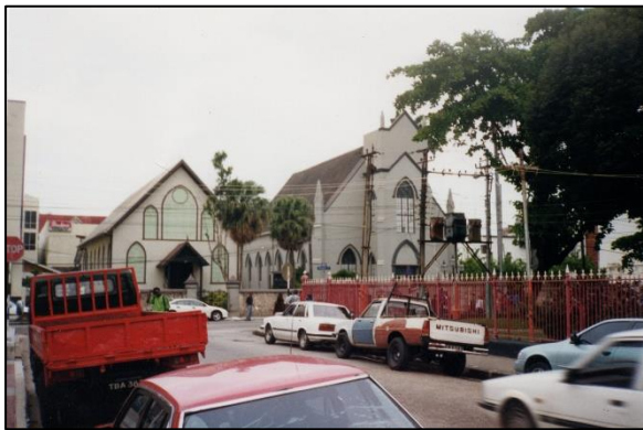
Greyfriars/St Anne's Church and Hall

Well, what was the problem? Trinidad is situated far to the south of the Caribbean, and you can in fact see the coast of Venezuela from the coast of Trinidad. It is over 1,500 miles from the nearest Church of Scotland, which is to the north in Bermuda. The Board of World Mission in Edinburgh had resolved that it made sense to merge the Greyfriar's/St Anne's congregation into the Presbyterian Church of Trinidad and Tobago. Well, many of you may remember the Cuban missile crisis in the 1960's - that had nothing on this!