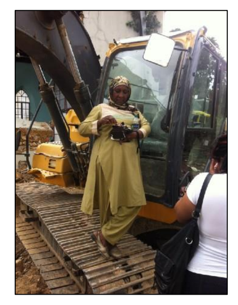
to this (and beyond):