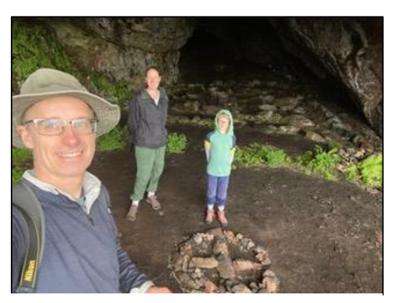
Church Cave, Isle of Rona *

It is not 'completely calm' yet, and if there's anything we have learned over the past eighteen months or so, it is that there is always the possibility of another storm brewing over the horizon.