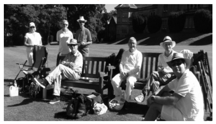
Relaxing after play